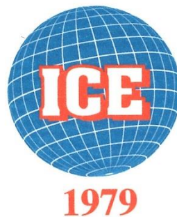
International Caribbean Enterprises