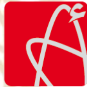
أجاد لإدارة المنشآت Ajad facilities Management