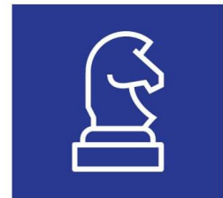
FREDMAN Strategy Group